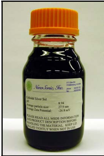
Colloidal Silver Nanoparticles 250 mL quantity shown